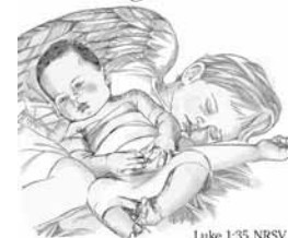
Luke 1:35, NRSV

"The child to be born will be holy; he will be called Son of God."