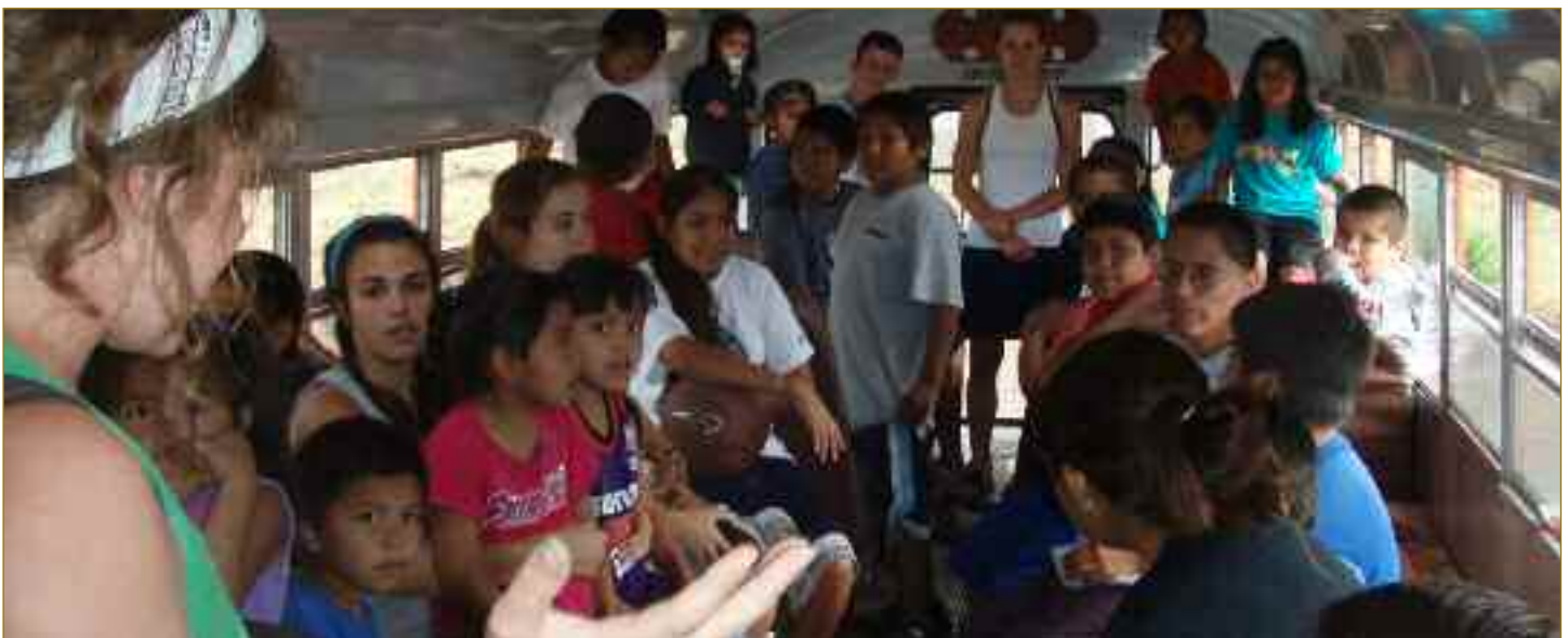
Bus run with Virginia group