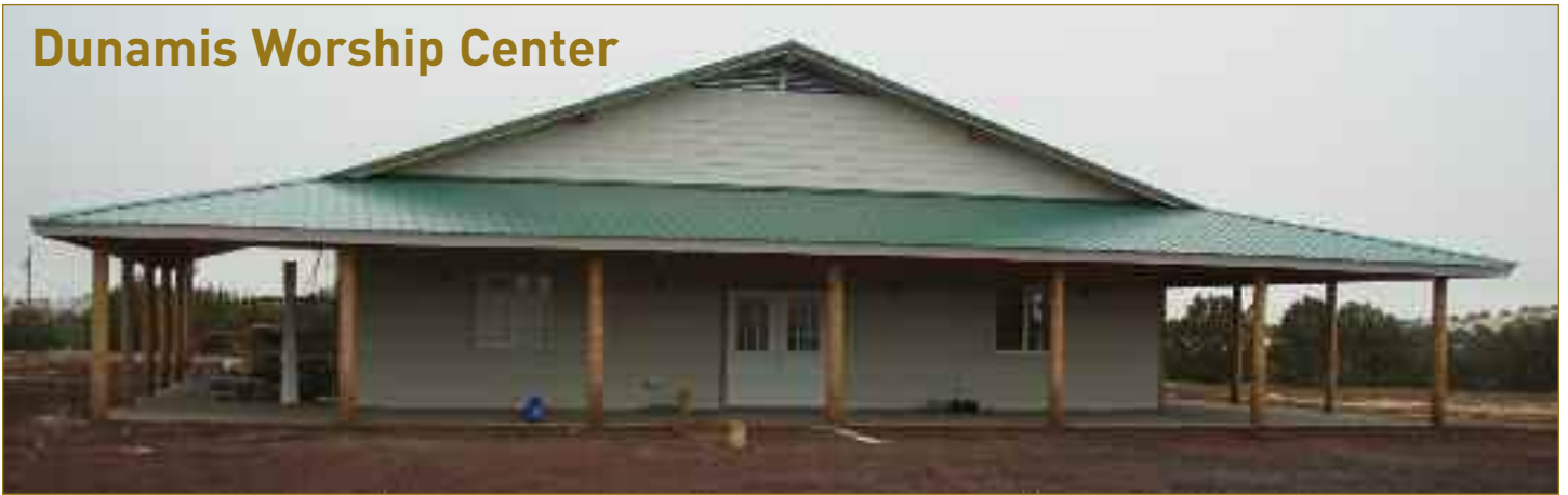
Dunamis Ranch Worship Center from the south.

Over the past year, expansion of Dunamis Ranch has begun with the building of the Worship Center. This building will provide housing for short term mission teams, allow for spiritual retreats for Apache individuals, couples, and families, and create many other opportunities to help the staff of Dunamis Ministries in disciplining Apaches. With the help of over 20 short term mission work teams, the building has almost reached completion. God provided all the finances for the building as it was needed. A special thank you goes out to all the many individuals who helped to build this extraordinary tool for ministry through prayer, financial support, and physical labor.