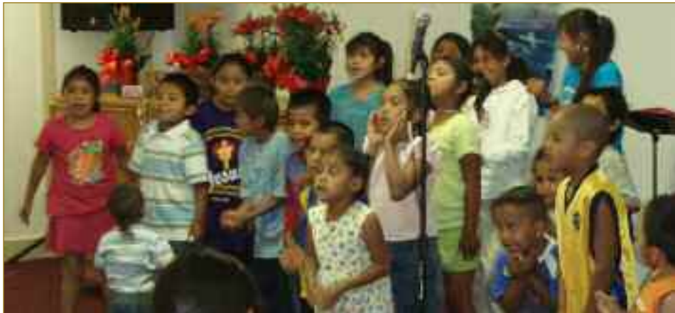
Kids leading songs at the WMACC.

While the church first began holding meetings at Canyon Day Middle School, we were soon asked to look for a new location. We were blessed to be given access to an