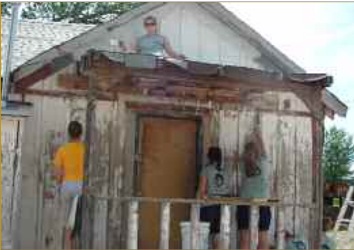
Mt. Olivet Christian Churches work team paints a house.

• We need help funding the lease of WMACC's new facility. There is not money in our budget to absorb this lease. We need individuals willing to commit a $100 a month over periods of one to three years (certainly annual and one-time gifts are appreciated and needed). Monthly commitments will help our cash flow and will go through Dunamis Ministries directly to the lease of this property.