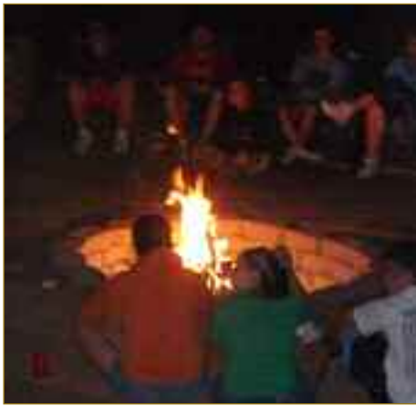
Work team around the campfire at the Ranch.

congregation to a matching dollar program. For each dollar raised by our Apache congregation, matching dollars will be provided to help them renovate—demonstrating their commitment. Second, the goal is to provide future resources to exercise the option to purchase this building at the end of the seven year lease—debt free.