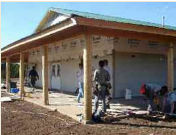
The Amish working on the siding.